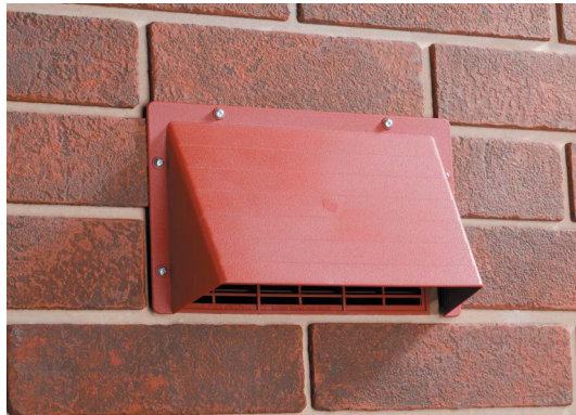
External grille with cowl