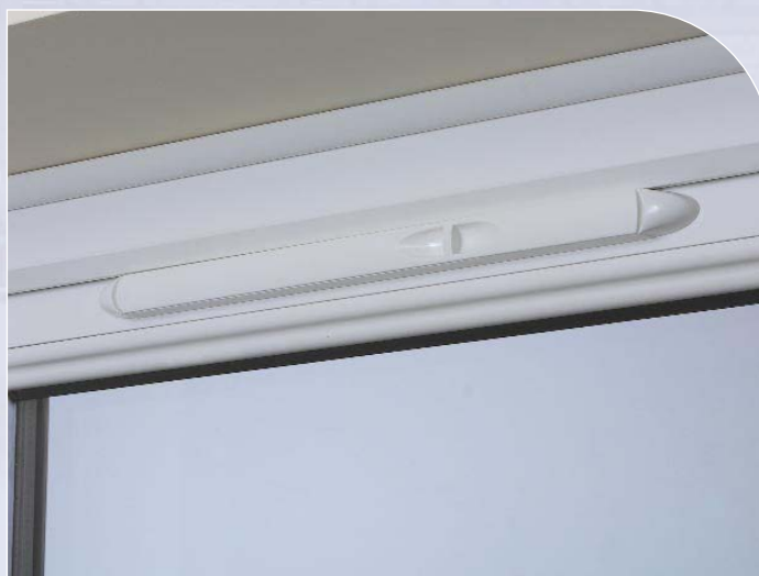
Trimvent Select S16 ventilator