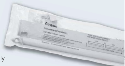
Typical Trimvent Select Xtra pack

This makes both the specifier and the window fabricators' jobs easier. The specifier can pick Titon products to ensure compliance for a choice of ventilation systems in different dwelling types, without constant specification change. The fabricator is safe in the knowledge that only the minimum number of ventilators required need to be used to achieve this compliance.