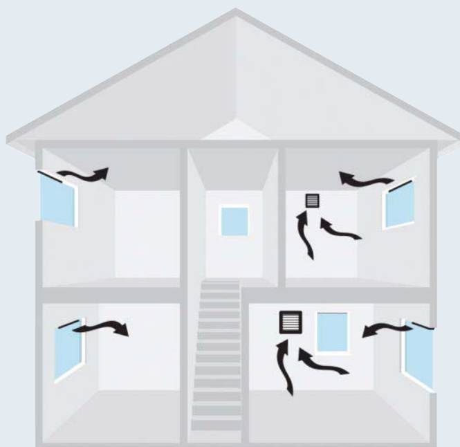
System 1 - Background (trickle) ventilators and intermittent extract fans